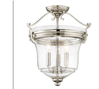
Convertible to Semi Flush