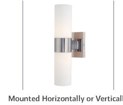
Mounted Horizontally or Vertically