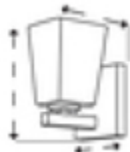
Image File Name: A581-BG.jpg