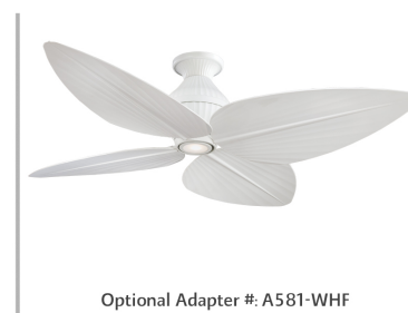
Optional Adapter # A581-WHF Shown with F581-WHF (Fan Not Incl.)