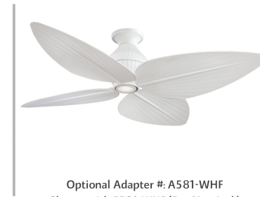
Optional Adapter #: A581-WHF Shown with F581-WHF (Fan Not Incl.)