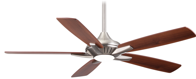
Reversible Blades - Dark Walnut