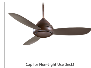
Cap for Non-Light Use (Incl.)