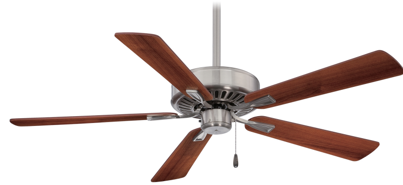
Shown with Reversible Dark Walnut Blades