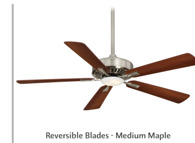
Reversible Blades - Medium Maple