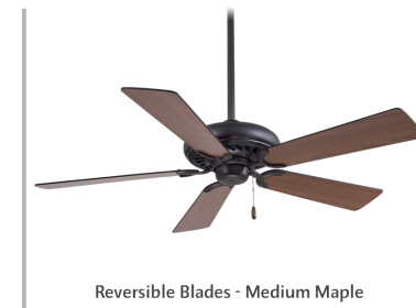
Reversible Blades - Medium Maple