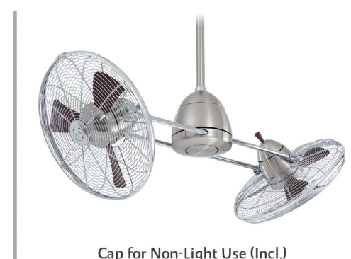
Cap for Non-Light Use (Incl.)