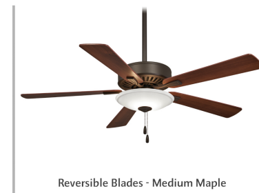
Reversible Blades - Medium Maple