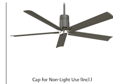
Cap for Non-Light Use (Incl.)