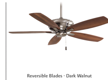
Reversible Blades - Dark Walnut