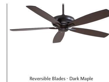
Reversible Blades - Dark Maple