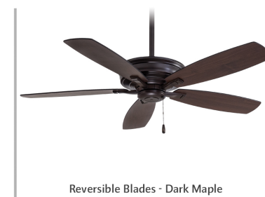
Reversible Blades - Dark Maple