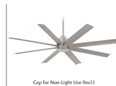
Cap for Non-Light Use (Incl.)