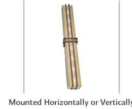
Mounted Horizontally or Vertically