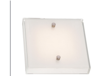
Mounted Horizontally or Vertically