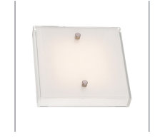
Mounted Horizontally or Vertically