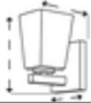
Image File Name: P1403-613.jpg