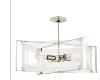
Convertible to Semi Flush