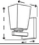
Image File Name: P4035-084.jpg