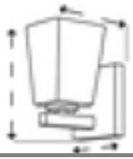
Image File Name: P4305-084.jpg