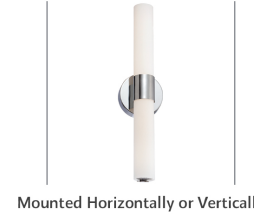
Mounted Horizontally or Vertically