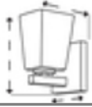
Image File Name: P5042-077-L.jpg