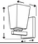
Image File Name: P5042-077-L.jpg