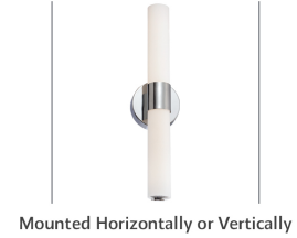
Mounted Horizontally or Vertically