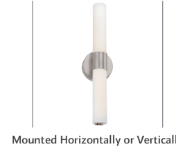
Mounted Horizontally or Vertically