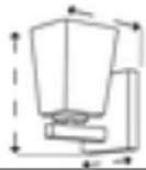
Image File Name: P5042-084-L.jpg