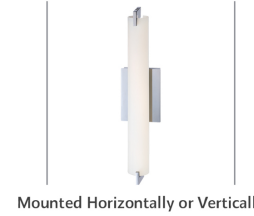
Mounted Horizontally or Vertically