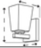
Image File Name: P5044-077-L.jpg