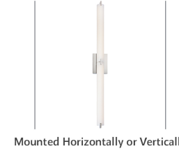
Mounted Horizontally or Vertically