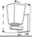
Image File Name: P5046-077-L.jpg