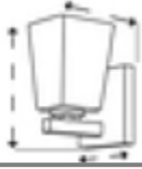
Image File Name: P5046-077.jpg