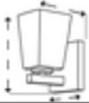
Image File Name: P5046-077.jpg