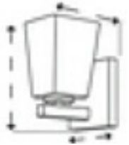
Image File Name: P5046-084-L.jpg