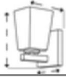
Image File Name: P5046-084-L.jpg