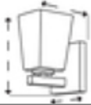
Image File Name: P5046-084.jpg