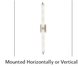
Mounted Horizontally or Vertically