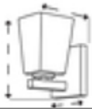
Image File Name: P5046-37B-L.jpg