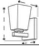
Image File Name: P5046-37B-L.jpg