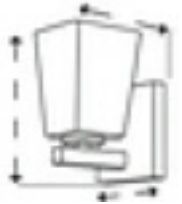
Image File Name: P5805-077.jpg